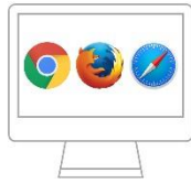
PC and Mac Chrome | Firefox | Safari